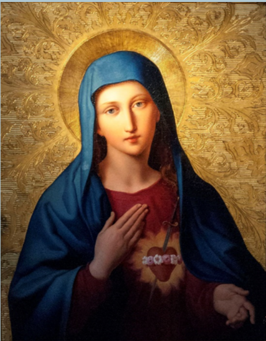
Icon of the Immaculate Heart © Leopold Kupelwieser and Diana Ringo, CC BY-SA 4.0 ( https://creativecommons.org/licenses/by-sa/4.0/legalcode )